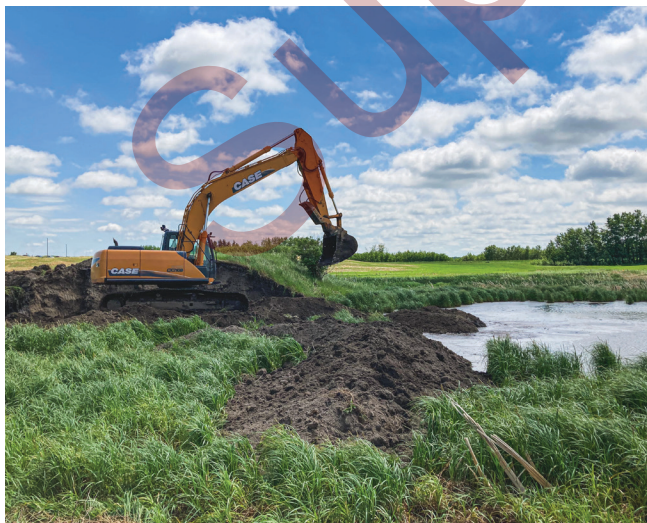
Recontouring a historical dugout to restoring a natural wetland.