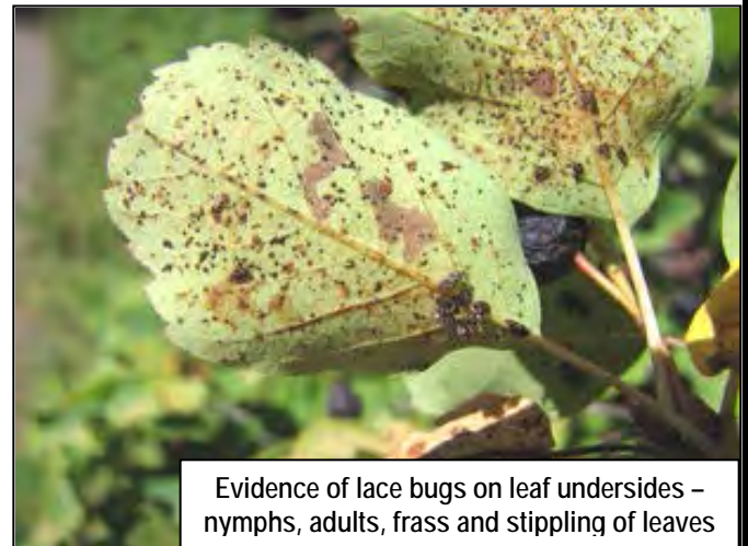
Evidence of lace bugs on leaf undersides – nymphs, adults, frass and stippling of leaves