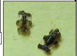
Hawthorn lace bug adults