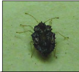
Hawthorn lace bug nymph