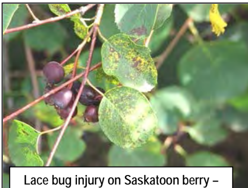
Lace bug injury on Saskatoon berry – yellowing / stippling