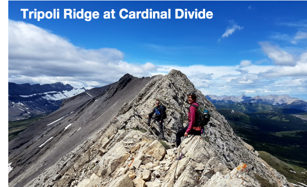
Tripoli Ridge at Cardinal Divide

Try your luck at catching colorful rainbow trout at Wildhorse Lake and then hike around the rustic trail while enjoying views of the mighty Rockies.