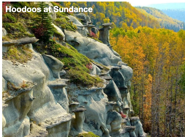
Hoodoos at Sundance

For those who enter the Willmore on foot, this is the first step. The trail begins at the southwest corner of the Sulphur Gates Staging Area. Follow the trail (actually an old fire road) for 2 km, then keep a lookout for a moose antler sign marking the trail junction to Eaton Falls.