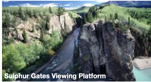
Sulphur Gates Viewing Platform