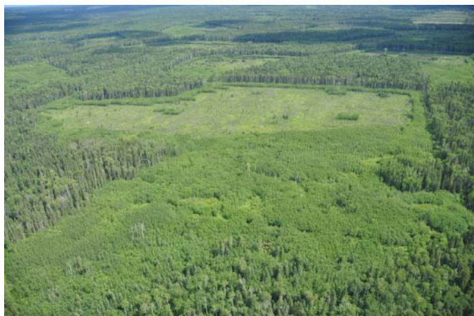
Figure 2. Area reforested after harvesting.

The seed tree harvesting method involves clearcutting, but leaves evenly-spaced mature