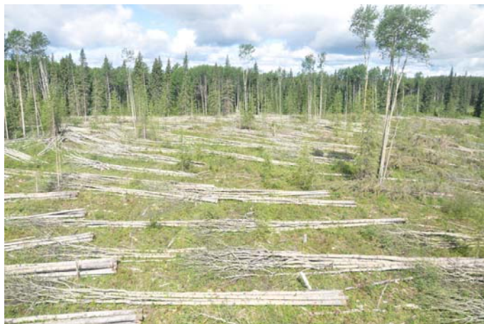
Figure 1. Area recently harvested.

regrowth of such fire-adapted species, over partial harvesting methods.