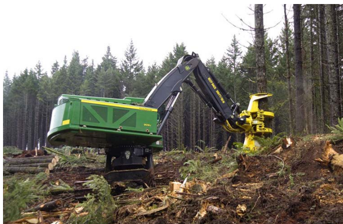
Figure 3. A feller buncher used for timber harvesting.

Once the harvesting method is selected, the forest manager determines the type of harvesting equipment, such as a feller buncher (Figure 3), to be used.