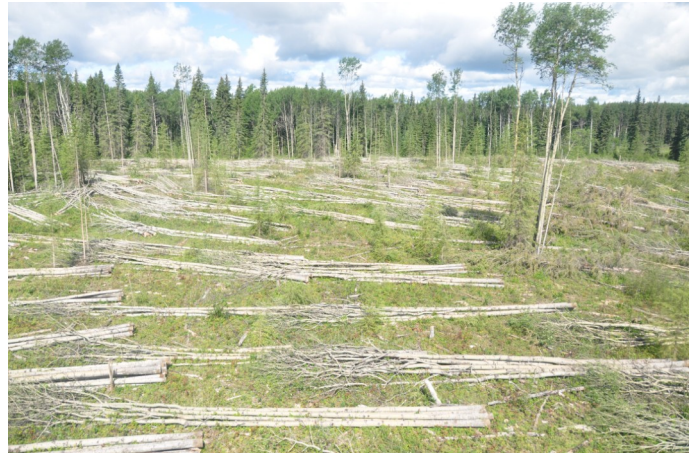
Figure 1. Area recently harvested

regrowth of such fire-adapted species, over partial harvesting methods.