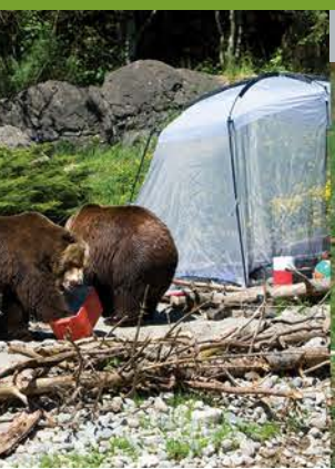
mistaken for black bear