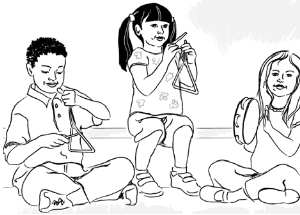
These students are playing music together.

Students learn new things in different ways. They use computers, books and equipment. They learn by trying things and talking with others. Sometimes students work in groups. Sometimes the whole class works together.