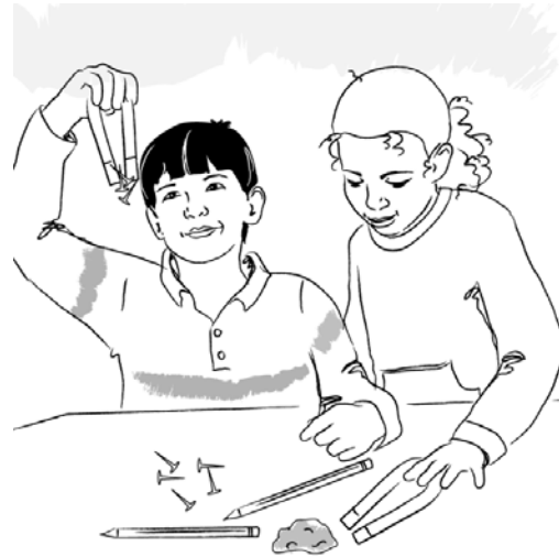
These students are learning to experiment.

Students learn from their teachers. Students learn from each other. And they learn from you!