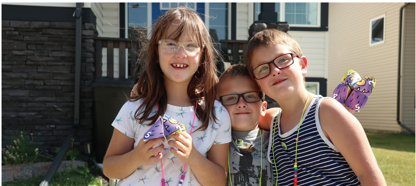
Three happy readers show off their crafts and reading progress lanyards.

Sundre Municipal Library provided “take and make” kits designed to promote mental health and support isolated adults and seniors within its community. An evolution of the family activity kits that the library provided from the early days of the COVID-19 pandemic, these kits for adults and seniors were developed specifically to combat the negative effects of stress and isolation. Each kit centered on a particular theme and bundled together activities, items, and library resources that promoted social connection, healthy living, self-care, and relaxation. The library also partnered with local businesses, family support organizations, and primary care networks to source materials and resources for various kits, further increasing the value for the community.