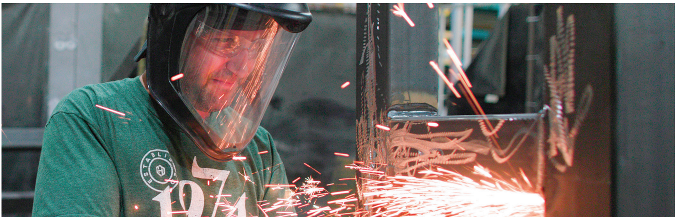
Permit and Licensing Improvement foster faster process for businesses

The City of St. Albert implemented online business licensing and permitting applications to allow businesses to start-up more efficiently in the City, effectively reducing red tape. By allowing applications to be accepted online, the City has been able to reduce wait times and streamline the application process for businesses. Further, St. Albert has maintained best in class approval times and brought significant developments into the City during the height of the pandemic.