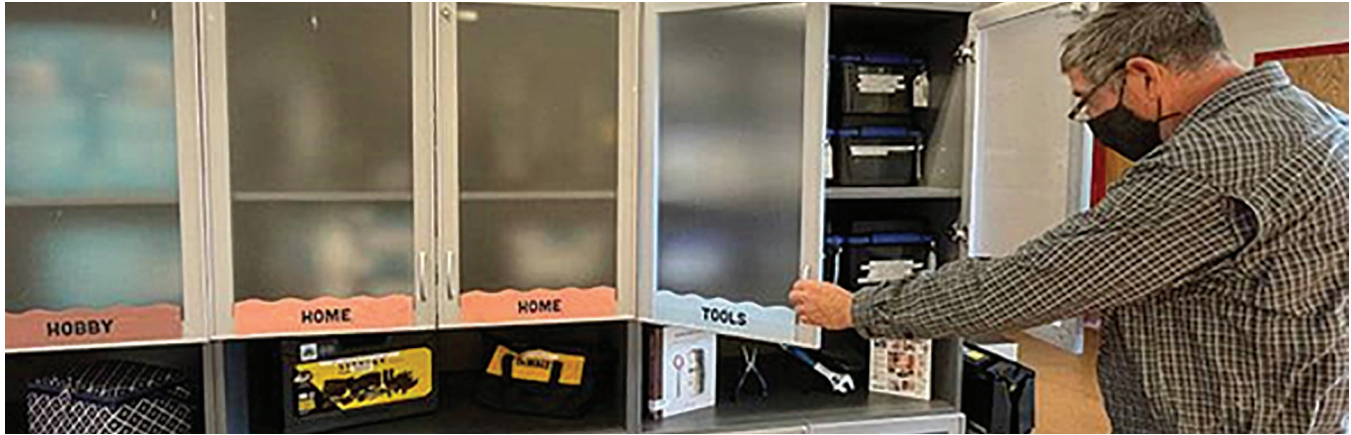
A patron browses through some of the tools available in the Library of Things.

The Public Library Services (serving under 10,000 population) awards are given for two library service initiatives that demonstrate excellence and innovation. The initiatives should also demonstrate responsiveness to community needs and provide direct benefit to the public.