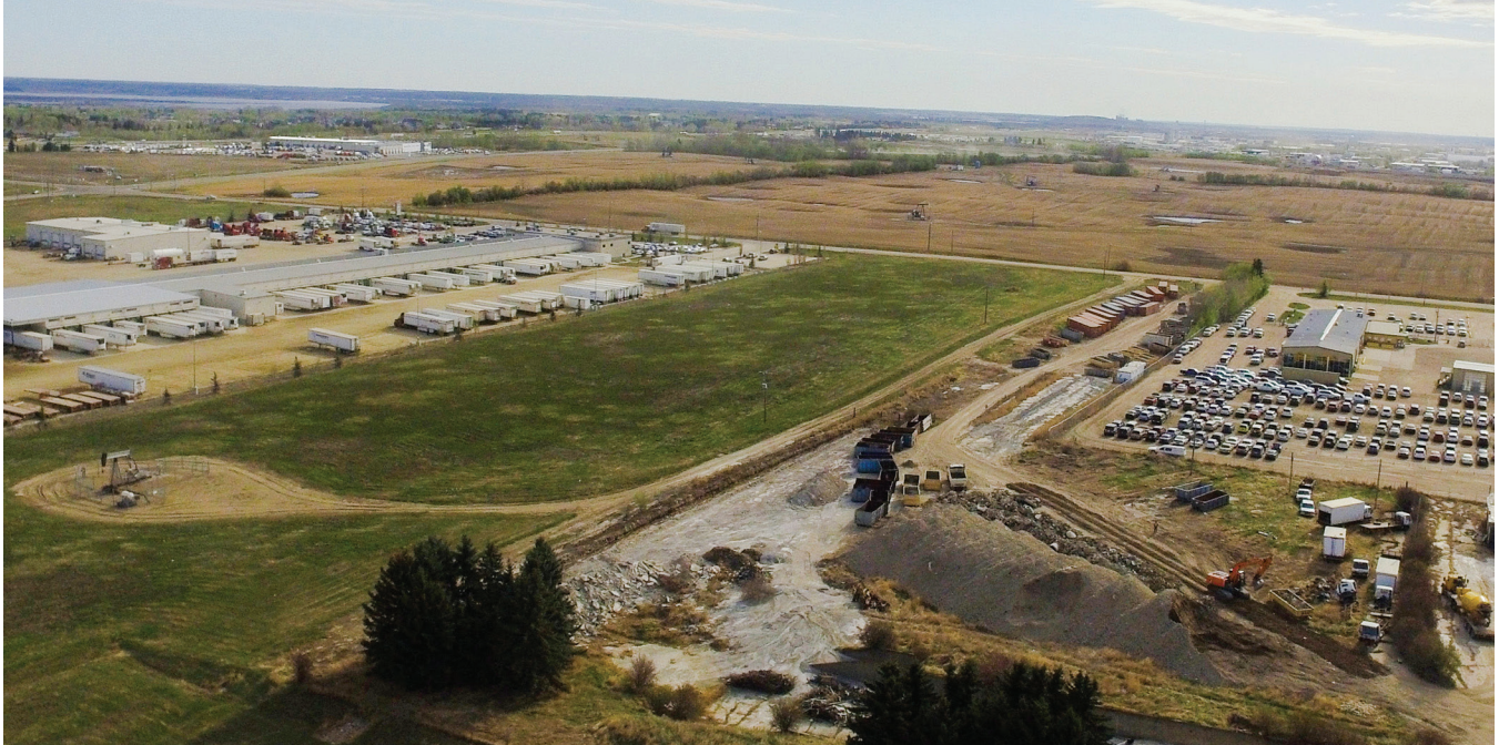
Businesses as a result of the Major Business Attraction Initiative in Parkland County

The Building Economic Strength award is given for an innovative initiative that builds the economic capacity and/or resiliency of the community and/or improves the attractiveness of the community to businesses, investors, and visitors.