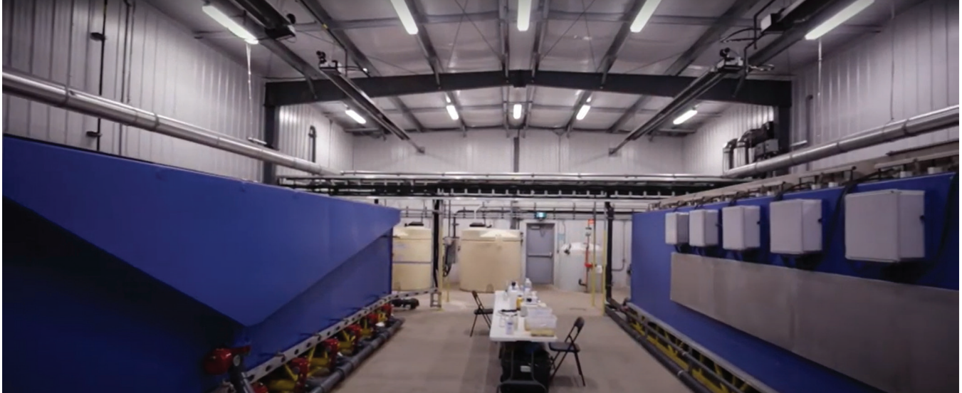
Town of Sundre Wastewater Project

The Smaller Municipalities category is open to municipalities with populations less than 5,000. The award is given for a municipal initiative that demonstrates leadership, resourcefulness or innovation, or both, to better the community.