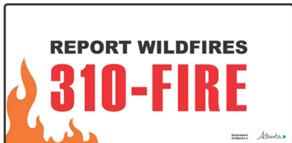
Figure 3 – Wildfire Prevention Sign 3