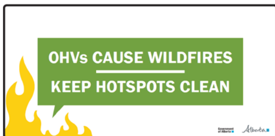
Figure 4 – Wildfire Prevention Sign 4