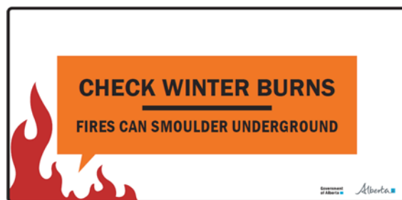
Figure 5 – Wildfire Prevention Sign 5

The Wildfire Danger sign is included below. It consists of a white and black background with a triangular cutout to show the level of wildfire risk.