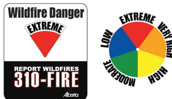
Figure 6 – Wildfire Danger Sign

Any departure from the sign specifications, as well as any new sign designs will need to be approved by Alberta Transportation. Proposed new sign designs should be forwarded to Alberta Transportation, Technical Standards Branch for consideration and approval.