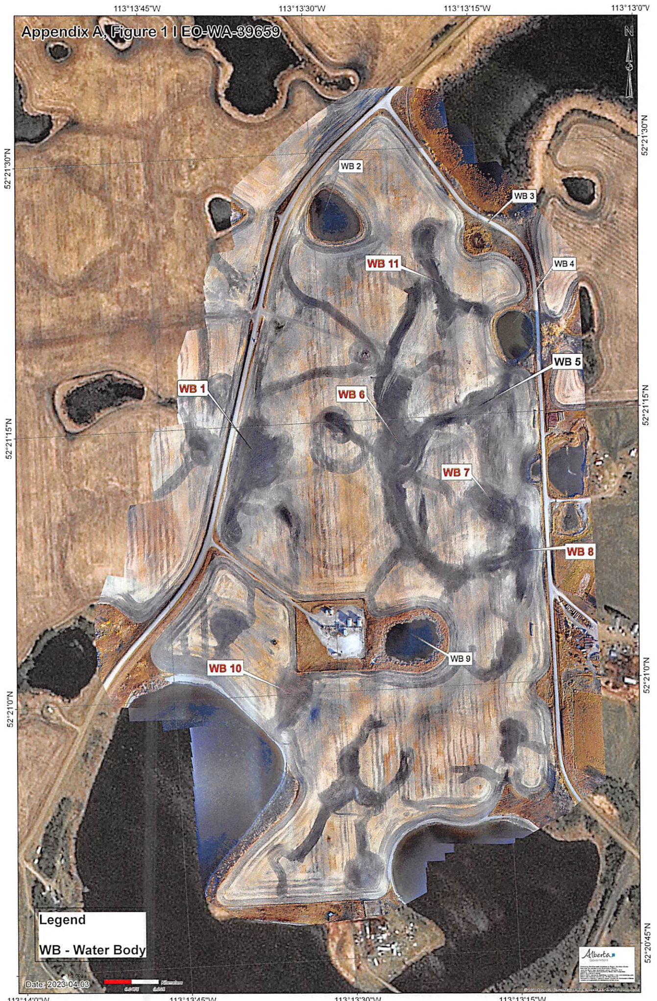
Appendix A, Figure 1 | EO-WA-39659