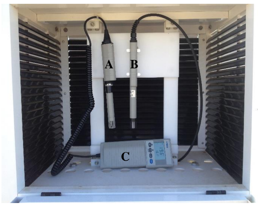
Figure 1. Inside of Stevenson Screen: (A) Standard Probe (B) Station Sensor (C) Standard Display.

The acceptable standards used for temperature output is \pm 0.50 °C and \pm 5 % for RH. The station sensor is ideally tested with the standard probe immediately next to it, if at all possible, either inside the Stevenson Screen with the sensor (Figure 1), or in a similar gill shield directly next to the one installed at the station (Figure 2). Ideal conditions for a field check include a breeze and a continuous sky cover; calm conditions and changing cloud cover make it difficult to get a constant reading between the field standard and station's sensor.