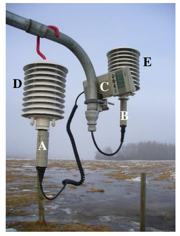
Figure 2 . Station Sensor and Standard Probe Both in Gill Shields: (A) Standard Probe (B) Station Sensor (C) Standard Display (D) Mobile Gill Shield (E) Permanent Gill Shield.

If the sensor installed at the station is found to be out of range during this field check, it needs to be removed and replaced by the same type of sensor (ideally if available). This needs to be recorded and updated in the station inventory, and Quality Assurance/Quality Control Group within Agricultural Meteorology Unit needs to be notified to make the corrections to that specific output. As a general and historically practiced rule, the temperature and humidity readings are taken at the top of the hour. This is due to the fact that these parameters change rapidly throughout the day and the top of the hour time slot makes for the easier raw data comparison also aiding in eliminating the occurrence of repeat entries in the data. [Note: Although preferred, top of the hour readings are not required if the logged reading at the time of standard check is also provided.]