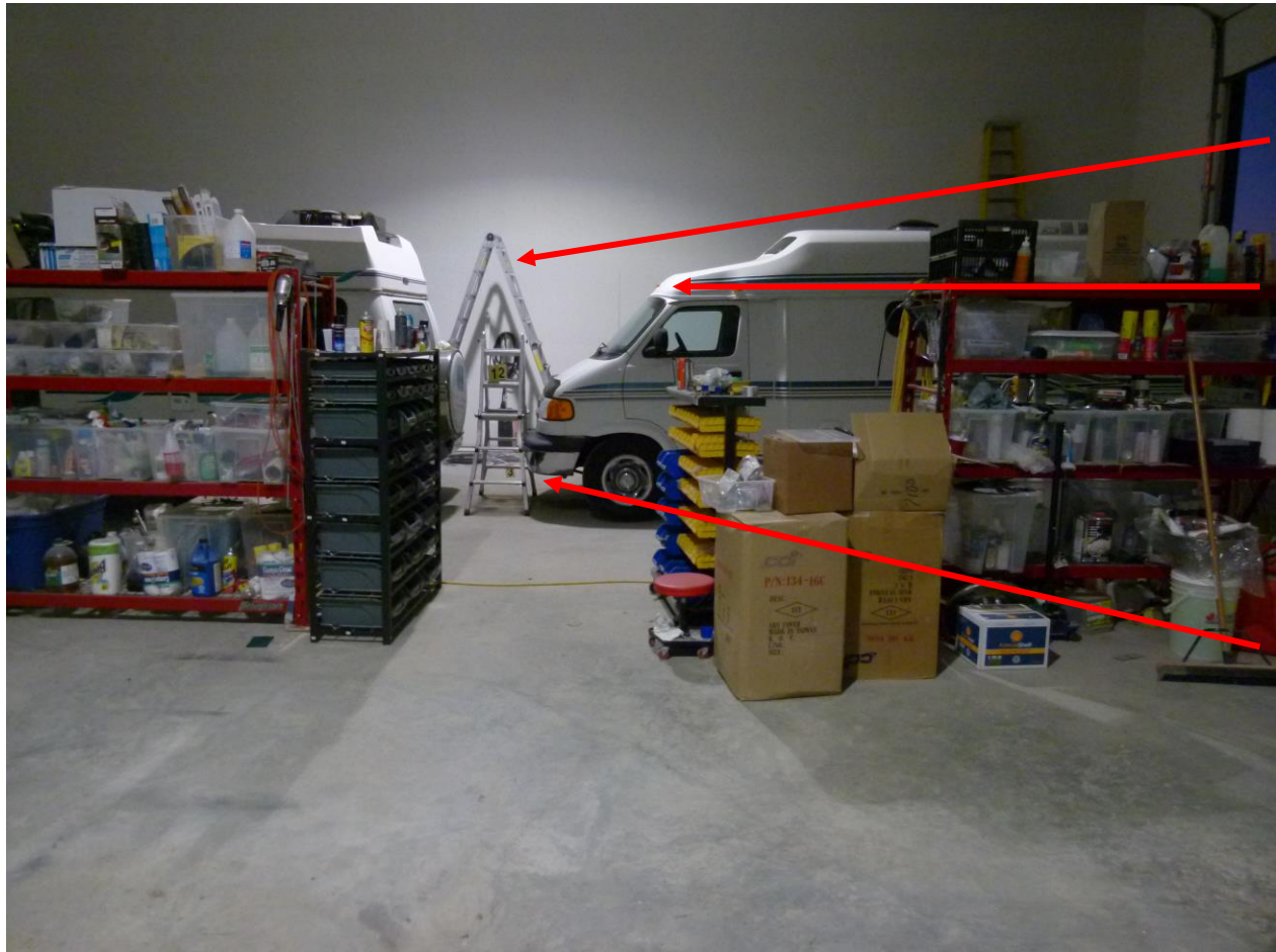
Photograph 2 – Shows the incident scene looking west.