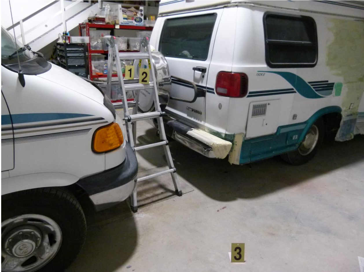
Photograph 5 – Shows the incident scene looking east/southeast. Markers 1 and 2 show the reported location of Worker 1’s (***** ***) feet. Marker 3 shows the approximate location where Worker 1 (***** ***) landed.