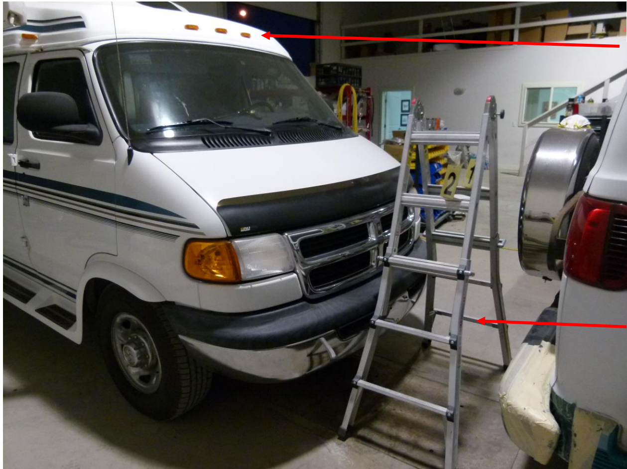
Photograph 4 – Shows the incident scene looking east/northeast. Markers 1 and 2 show the reported location of Worker 1’s (***** ***) feet.