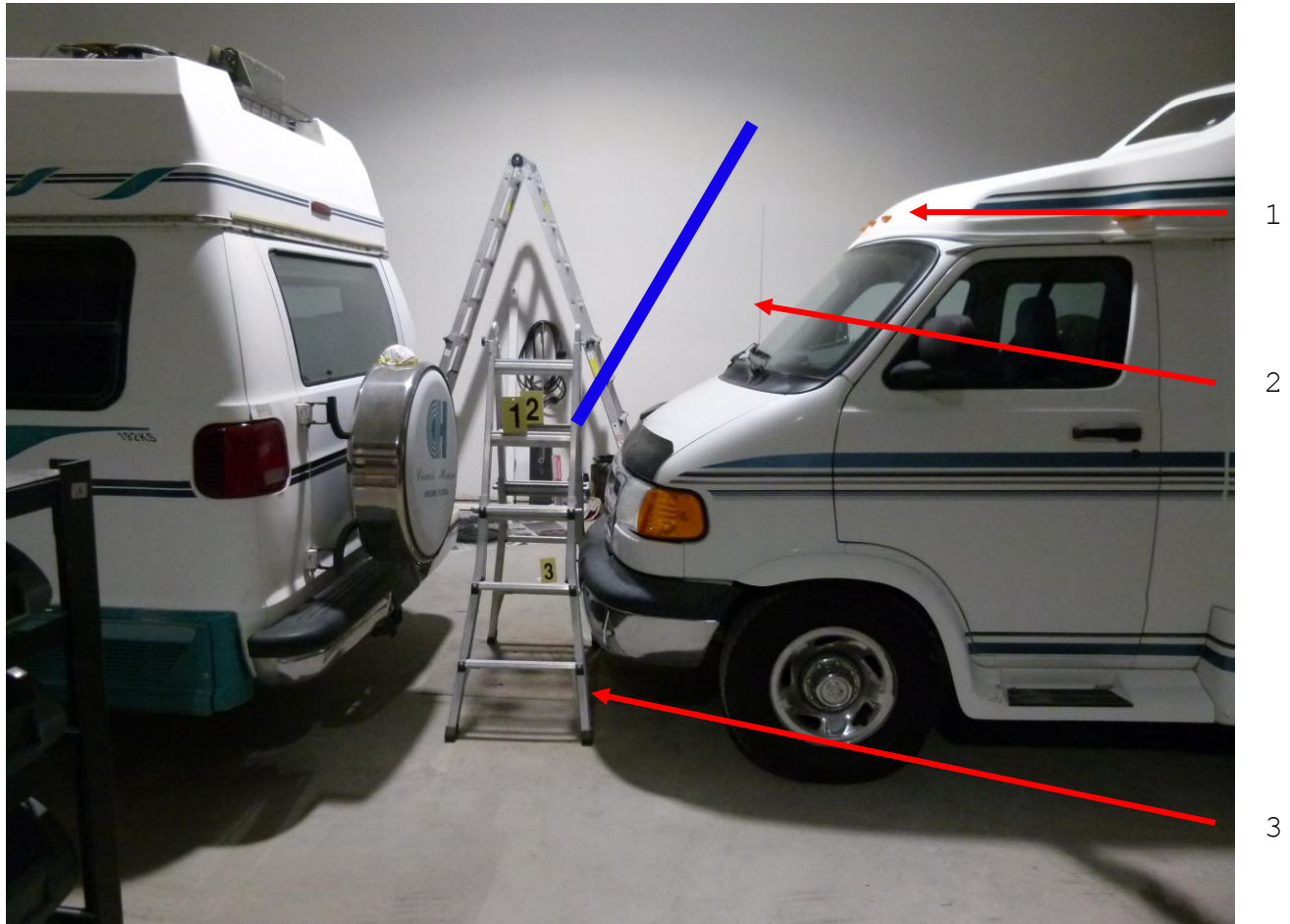
Photograph 3 – Shows the incident scene looking west. Markers 1 and 2 show the reported location of Worker 1's (***** ***) feet.