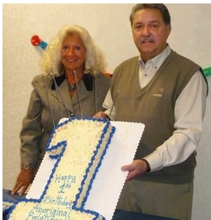
Aboriginal Relations Minister Gene Zwozdesky and Deputy Minister Maria David-Evans celebrated the Ministry’s first birthday on March 13, 2009 with department employees.