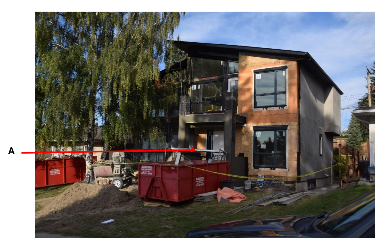
Figure 1. The front of 104 Cheyenne Crescent NW, Calgary, Alberta. A. The incident scaffold, work area and incident location

The work site was a single-family detached home located in the Charleswood community of Calgary, Alberta. The front of the home faced east, and was located at or near a standard residential roadway (Figure 1).