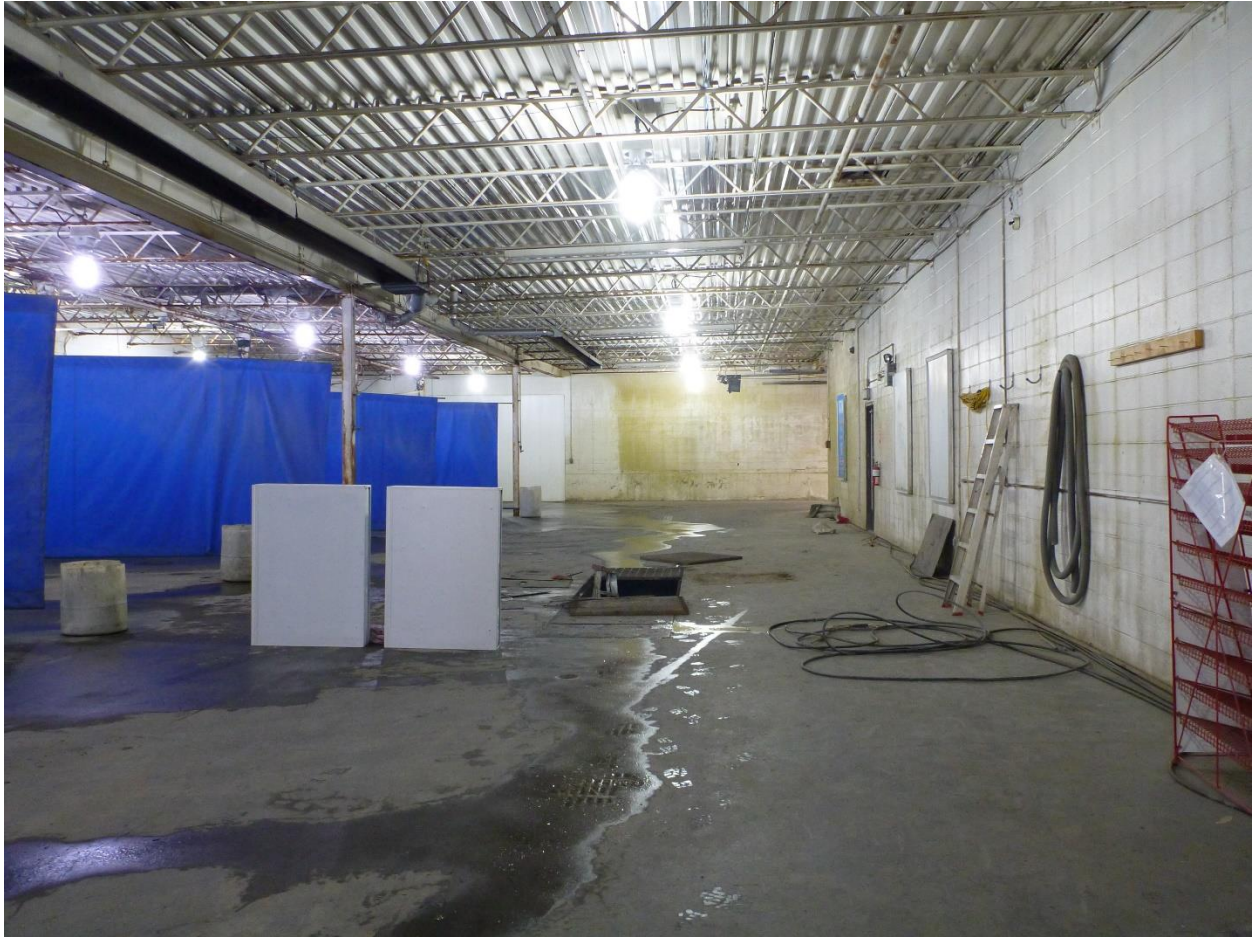
Figure 2. Car wash bays and sump pit.

During this cleaning process, the car wash was not closed to customers. A vehicle entered the car wash, and the driver proceeded to use the second bay from the entrance to clean their vehicle. Once they were finished, they backed out of the bay and attempted to proceed to the exit. The vehicle drove partially into the open sump pit at 12:29 p.m., striking and pinning the co-owner/manager of the car wash against the sump pit side. The co-owner/manager had been standing on the ladder in the sump pit, partially above the ground level.