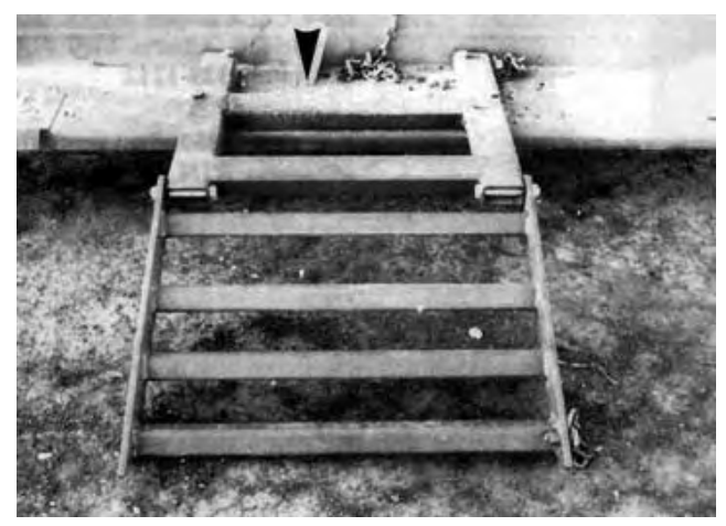
FIGURE 3. Windrower Loading Ramps Showing Spacer Added to Increase Header Clearance.

For most windrowers, there was insufficient header clearance for loading. The raised windrower header would strike the transporter arch as the windrower was driven on to the bed. A 50 mm (2 in) high spacer (FIGURE 3) was added at the top of each ramp to increase header clearance. This increased header clearance was adequate for loading some windrowers but for most windrowers, additional wooden blocks had to be placed on the bed and under the bottom of the ramp to achieve sufficient clearance.