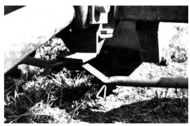
FIGURE 5. Bent Steering Tie Rod.

Weld Failures: The weld failure on the front axle appeared to be caused by insufficient weld penetration. The weld failure on the steering lug was caused by lowering the bed with the tongue turned at a sharp angle and hitched to the towing vehicle. The tongue should be relatively straight when lowering the bed to avoid overloading the steering mechanism.