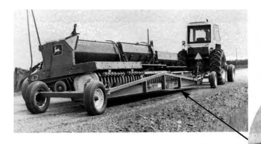
FIGURE 2. Doepker Transporter Loaded with Three Press Drills.