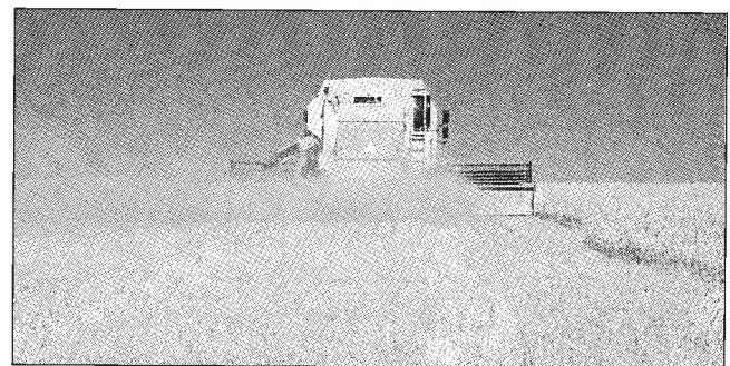
Figure 2. Straw residues evenly spread over cutting width

Straw choppers are available for all makes of combines as either factory or after-market options. Currently available chopper/spreaders can spread straw residues evenly over the entire cutting width for most Alberta conditions (Figure 2). Some can spread straw up to 50 feet (15 m) or more, but spreading over the entire cutting width for double 30-foot or double 40-foot windrows may be more difficult.