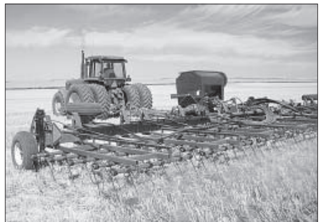
Figure 1. Heavy harrow

Canola produces a lot of fine material as chaff, which must be spread a long way from the combine's centre line to prevent obvious rows in the next crop. Heavy mats of canola residue will crust and push ahead of ground openers, resulting in plugging. A heavy harrow may be necessary to break this up (Figure 1).