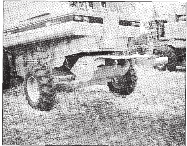
Figure 4. Combination spreader

Some types of chopper/spreaders can spread straw and chaff together. Mixing straw and chaff helps to provide a wide and uniform distribution of both (Figure 4).