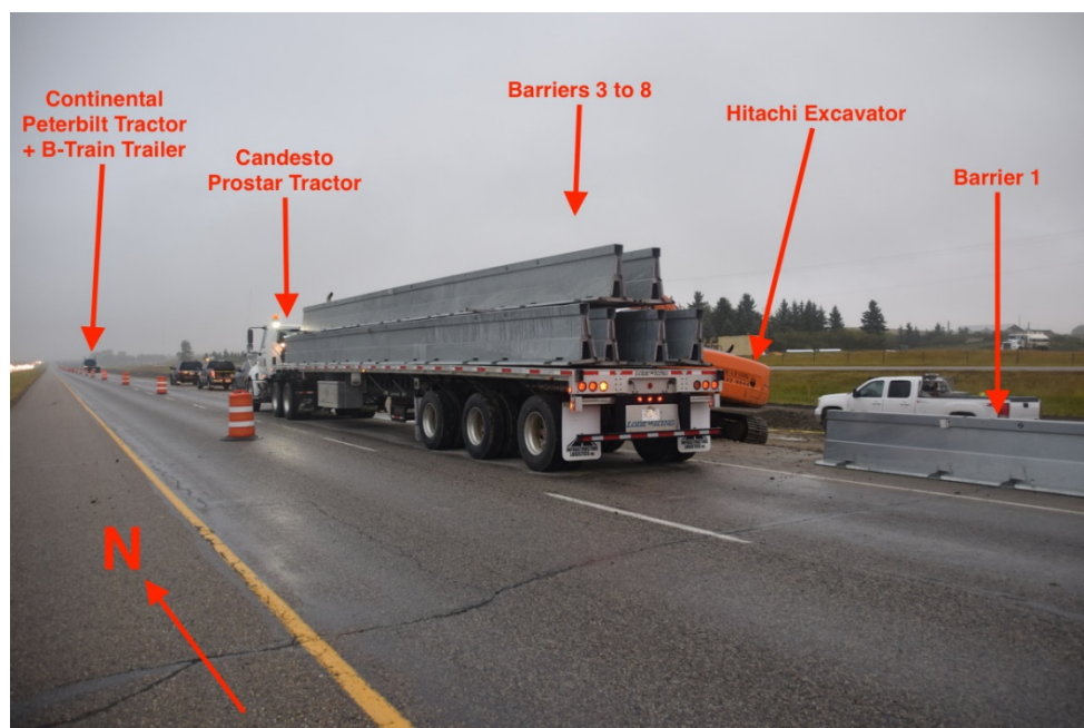
Figure 5. Diagram and site descriptions for the incident area on northbound Highway 2