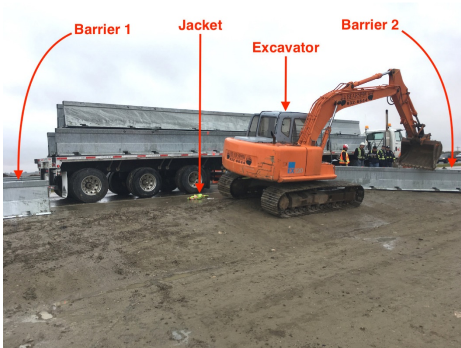
Figure 3. Diagram and site description provided to Occupational Health and Safety by Anderson Associates Consulting Engineers Inc. (Note: Barrier 2 struck Swamper 1)