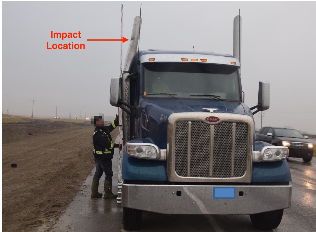
Figure 4. Continental Sales & Rentals Ltd. truck involved in incident, showing damage on the passenger side exhaust stack (Image provided by Anderson Associates Consulting Engineers Inc.)