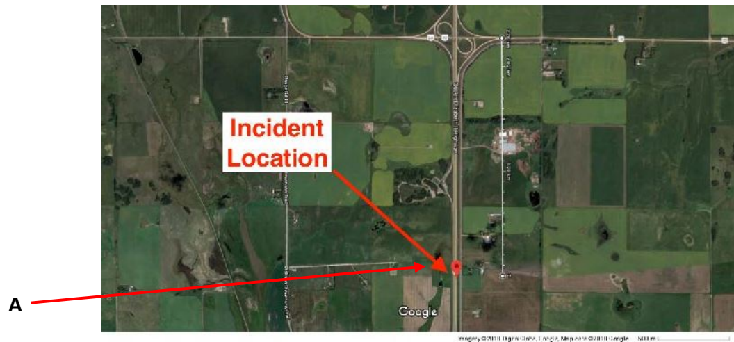
Figure 2. Approximate location of incident (Image provided by Anderson Associates Consulting Engineers Inc. Aerial Photo, Reference: Google Maps)