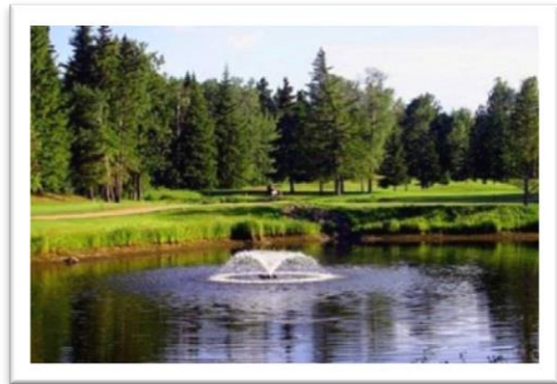
Black Bull Golf Resort