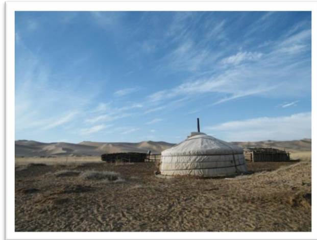
Yurt in Mongolia (Alex Mueller)

A yurt is the traditional dwelling of Central Asia nomads. Made to resist extreme climates, this circular shape abode has five basic elements: lattice walls, roof beams, a roof ring, a door, and a felt and hide covering. Since the 13th century, yurts have been used by nomadic horse herders as portable homes. It takes less than a day to deconstruct or set-up a yurt.