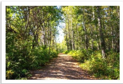
Pigeon Lake hiking trail

- Mini Golf and park for all ages. Beautifully landscaped, terraced greens, waterfalls. Gold Panning, Grass volleyball, Tetherball, Soccer, Sandbox, and Snacks also available. Located one block north of the Village at Pigeon Lake.