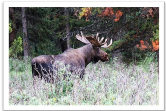
Bull moose (A.Cole)