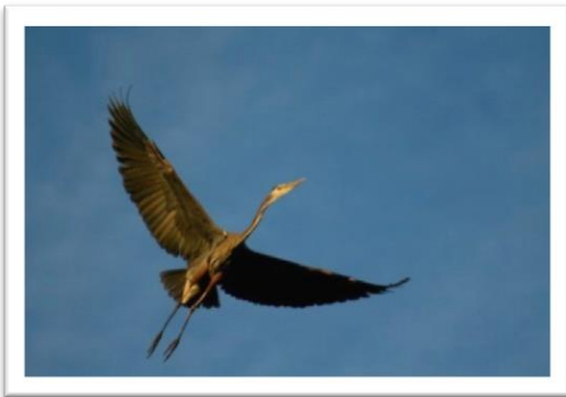
Great blue heron (A.Cole)