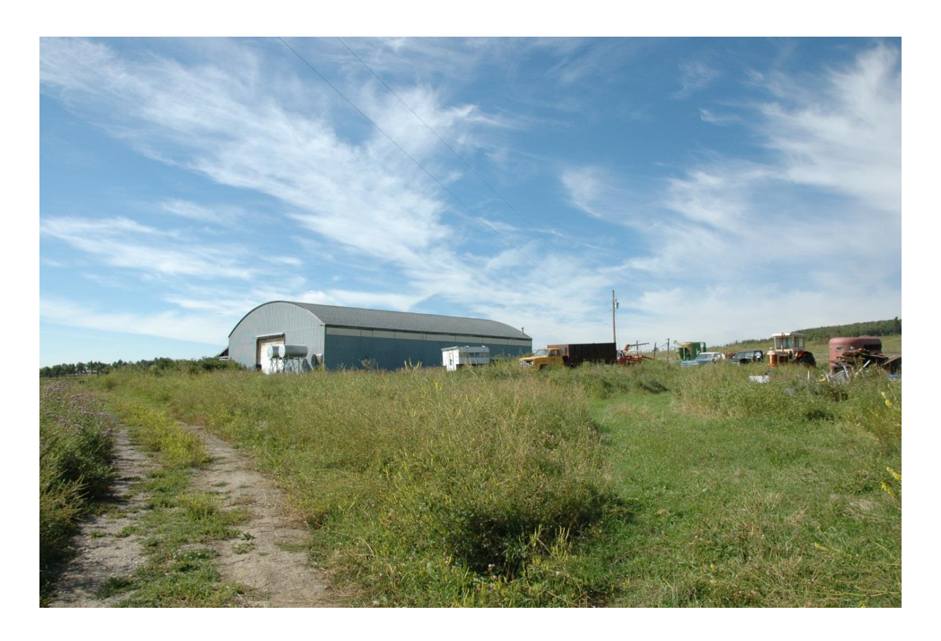
Looking Northwest, shows the Quonset where the incident occurred.