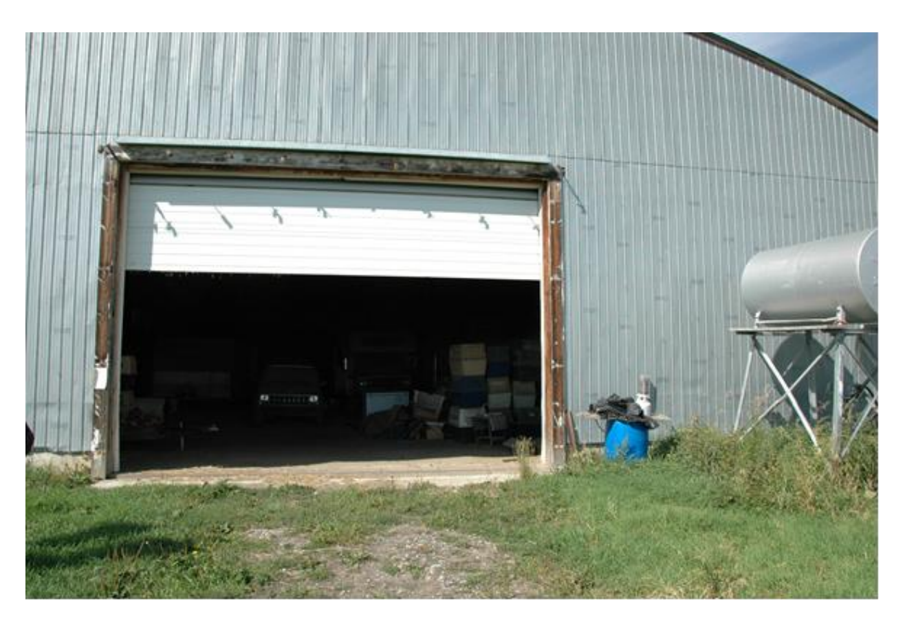
Shows the entrance to the Quonset where the incident occurred.