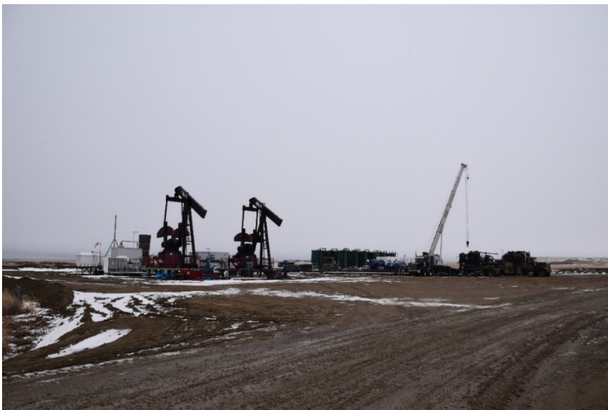
Figure 2. Twining Field (14-8) as viewed from lease gate looking west. The two active wells are shown in the foreground. The incident area is located near the crane.

At the time of the incident, there were two operational wells and two wells that were undergoing completion (Figure 2).