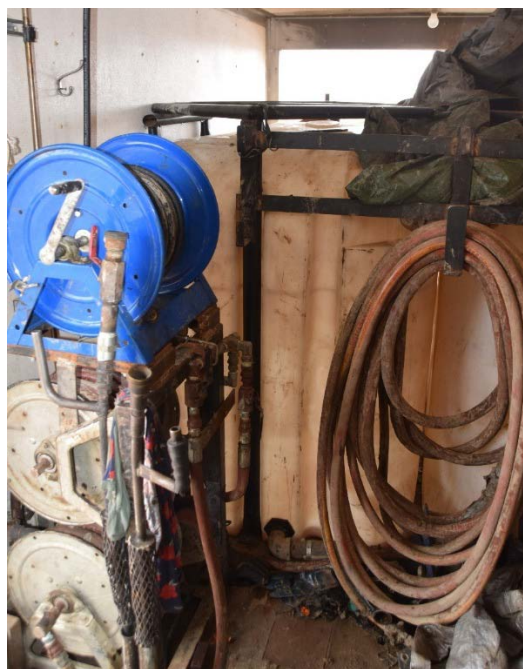
Figure 6. One of the two water tanks in the back of the cargo area of the steam truck, with the steam hose reels in the foreground. This was the tank that was involved in the incident.

Each water tank was 1.82 metres (m) long by 1.47 m tall by 1.22 m wide (Figure 6). Each were fitted with a 0.40 m diameter circular access on the top (Figure 7). The two tanks were connected together and drained into the boiler system simultaneously.