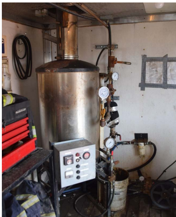
Figure 5. Oil-fired water boiler in the cargo area of the steam truck.

In the cargo area of the steam truck was a PowerJet PJ Oil Fired Water Heater (Figure 5), Isuzu diesel engine, and two water tanks with a combined capacity of 4 cubic metres (m 3 ).