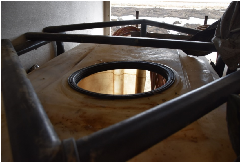
Figure 7. The access opening on the top of the water tank that was involved in the incident.