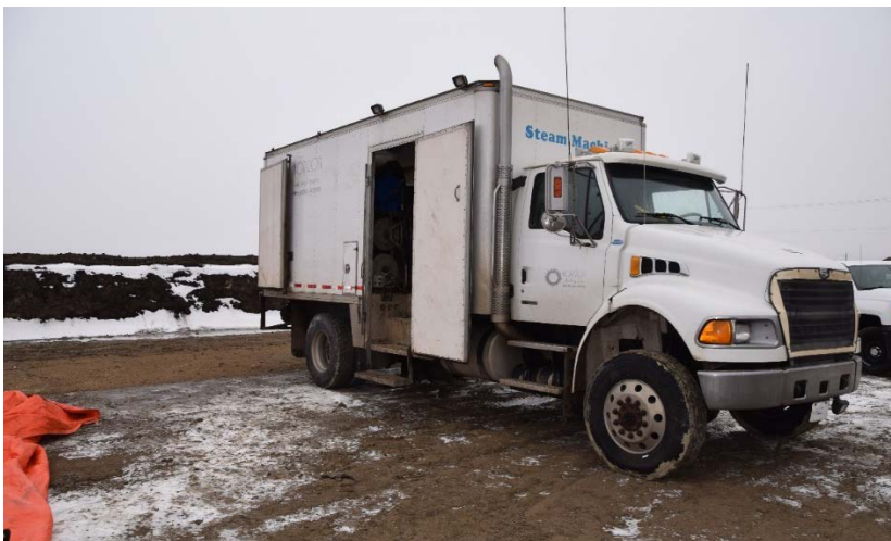
Figure 4. Horizon Oilfield Services steam truck on the Twining Field (14-8) showing the side access to the cargo area open.

The steam truck involved in the incident was a Thermo King Western Inc. cube van that was owned by Horizon Oilfield Services (Figure 4).