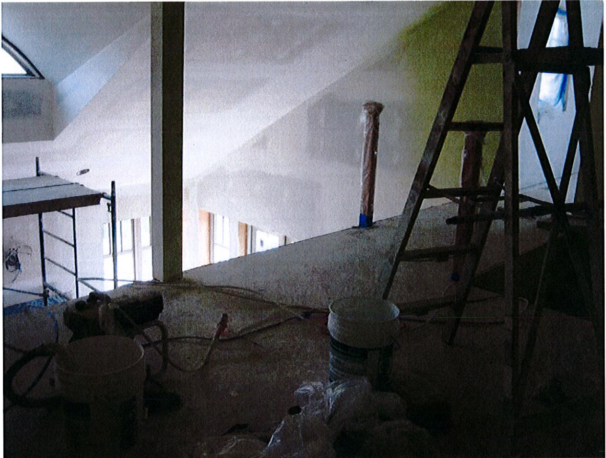
Photograph #4 Another view from the mezzanine where the Painter was working from at the time of the incident.