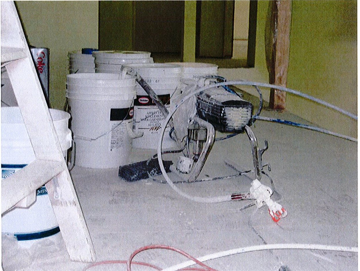
Photograph #2 Shows the paint sprayer and pails of paint the Painter was using at the time of the incident.