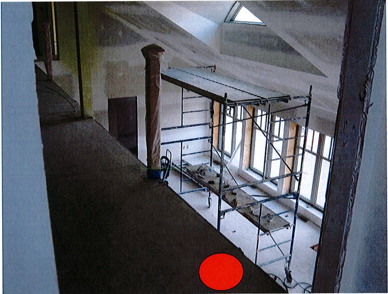
Photograph #3 The red circle indicates the area where the Painter was believed to be standing when he fell. There were no guardrails installed at the time of the incident.