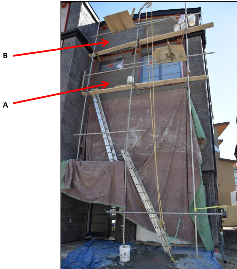
Figure 1. Single-pole scaffolding system in place at 115, 41 Ave SW, Calgary, Alberta on May 3, 2016, immediately after the incident. Based upon information provided to OHS immediately following the incident, worker 1 fell from the lower level (6.05 metres (m)) as indicated with arrow A. Arrow B indicates the approximate location where the second worker (employer) was located at time of incident (work platform height of 8.33 m).