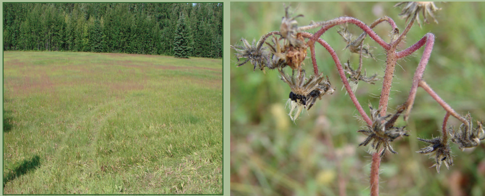
After Spraying – August 11, 2009