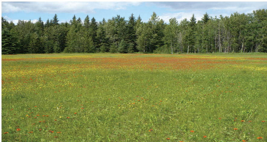
Orange Hawkweed Infestation Northeast of Athabasca - July 17, 2009

The Eastern Forest Threat Center website ( http://www.threatsummary.foresthreats.org/threats/threatSummaryViewer.cfm?threatID=269 ) states "Orange hawkweed prefers full sun or partial shade and well drained, coarse-textured soils. It invades urban sites, moist meadows, pasture, hay fields, roadsides, gravel pits, forested areas, tree plantations, and riparian areas. It forms extensive mats that can aggressively compete with forest understory plants for space, light, and soil nutrients. It has been reported to produce phytotoxic chemicals in pollen grains that inhibit seed germination, seedling emergence, or regeneration of other plants."