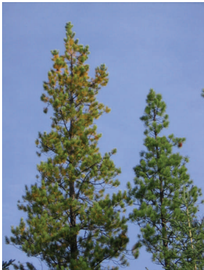
Fading green attack south of High Prairie