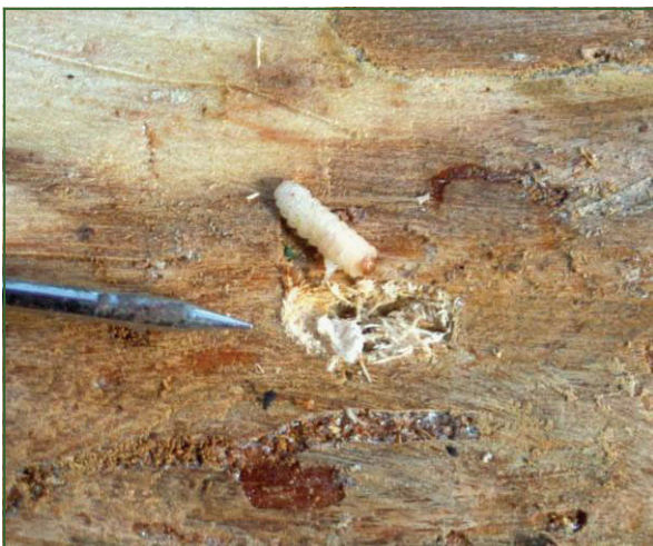
Hint: question #6.