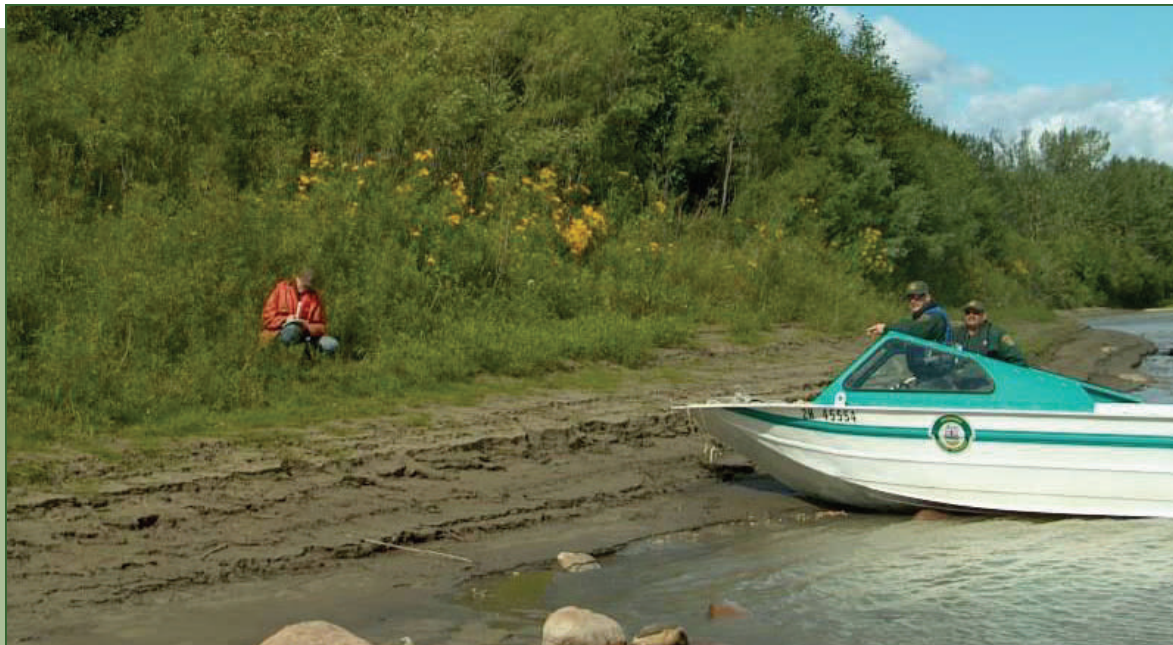
Common tansy survey along the Athabasca River in northeast Alberta.