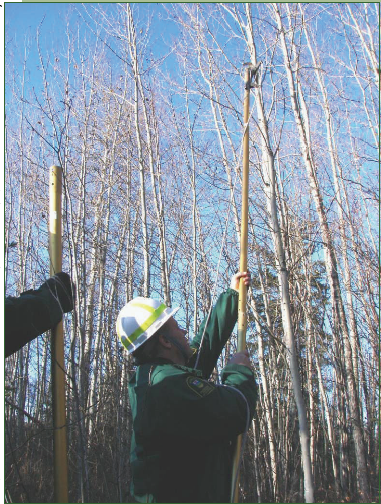
Forest Health Officer, Tom Hutchison, sampling forest tent caterpillar egg-masses.

“When forest tent caterpillar populations are high, they may be affected by cold mid-winter temperatures.”