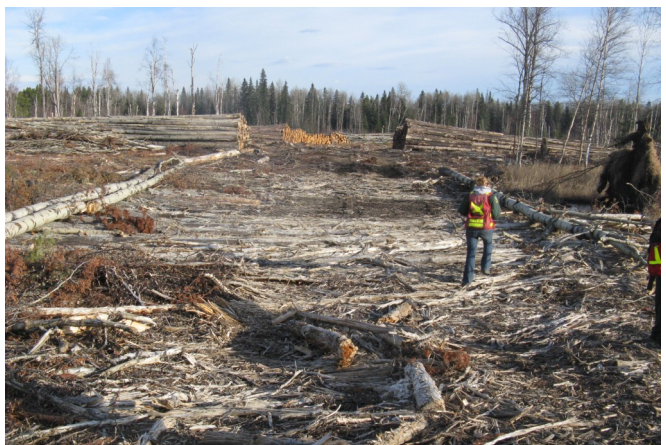
Figure 2. FOMP auditor inspecting a harvested area

SAM involves comparing samples of records from the Alberta Regeneration Information System (ARIS) database with the forest company's