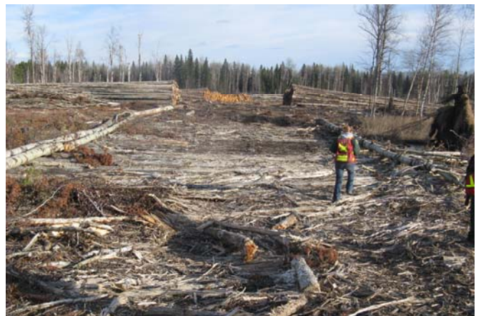
Figure 2. FOMP auditor inspecting a harvested area

SAM involves comparing samples of records from the Alberta Regeneration Information System (ARIS) database with the forest company's