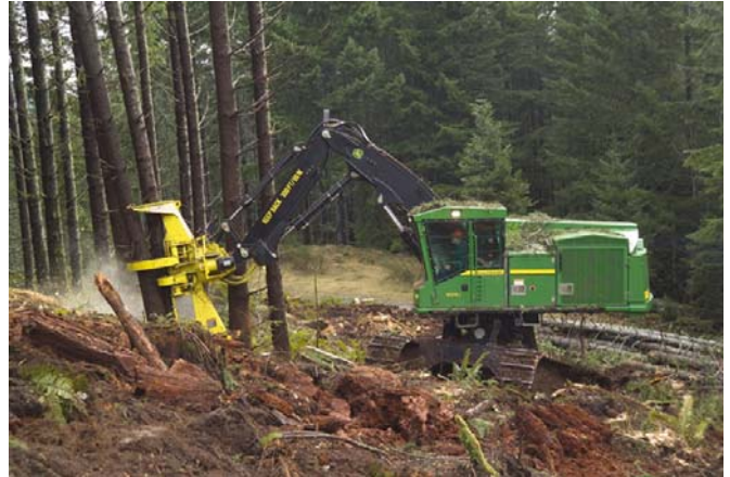
Figure 1. A timber harvesting operation

harvesting and reforestation activities to ensure they meet required provincial standards (Figure 2).