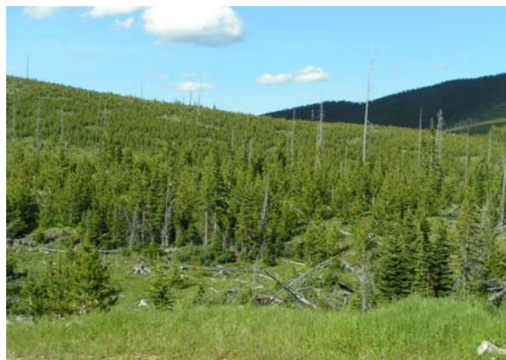
Figure 3. An example of a reforested area inspected by the department

All FOMP inspections are recorded in Alberta's Geographic Land Information Management and Planning System (GLIMPS) database. All non-compliant activities resulting in enforcement actions are recorded in the provincial Incident Reporting System (IRS) database.