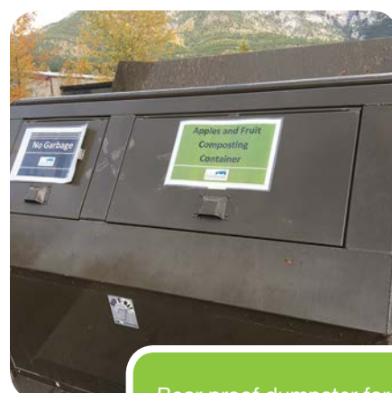
Bear proof dumpster for fruit