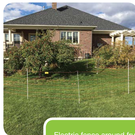
Electric fence around fruit trees