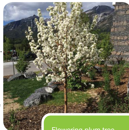
Flowering plum tree

Current programs within Alberta Environment and Parks (AEP) can help Albertans reduce chances of negative encounters with bears. On a case-by-case basis, AEP will loan electric fence kits and / or bear resistant containers to landowners who are experiencing bear problems. Call your local AEP office to determine if this program exists in your area. For additional information on how to prevent interactions with bears or other wildlife, visit Alberta BearSmart at bearsmart.alberta.ca .