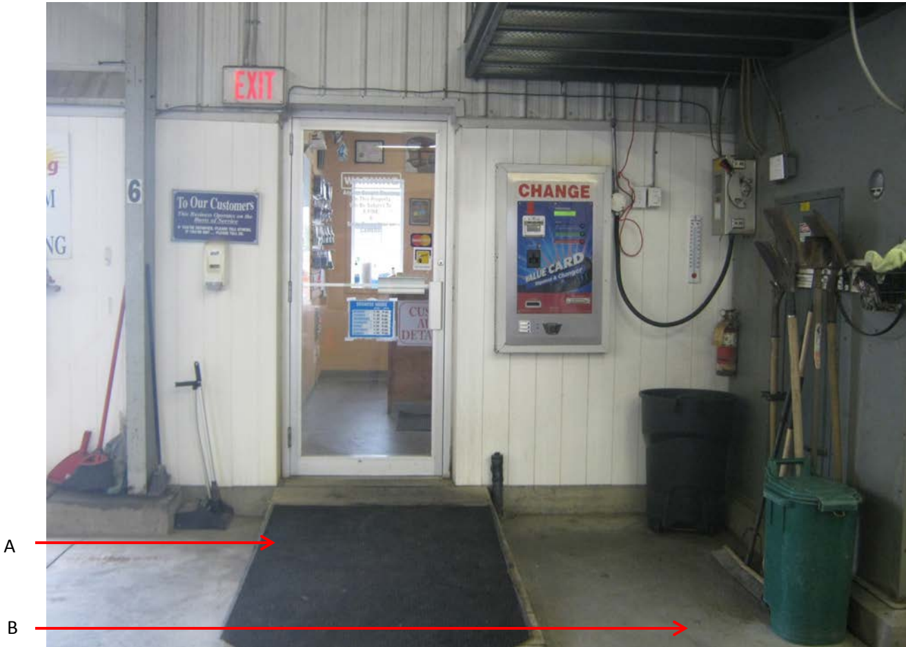
Figure 2. View of the door that enters into the wash bay from the front office. The ramp to access the wash area and the change machine location.