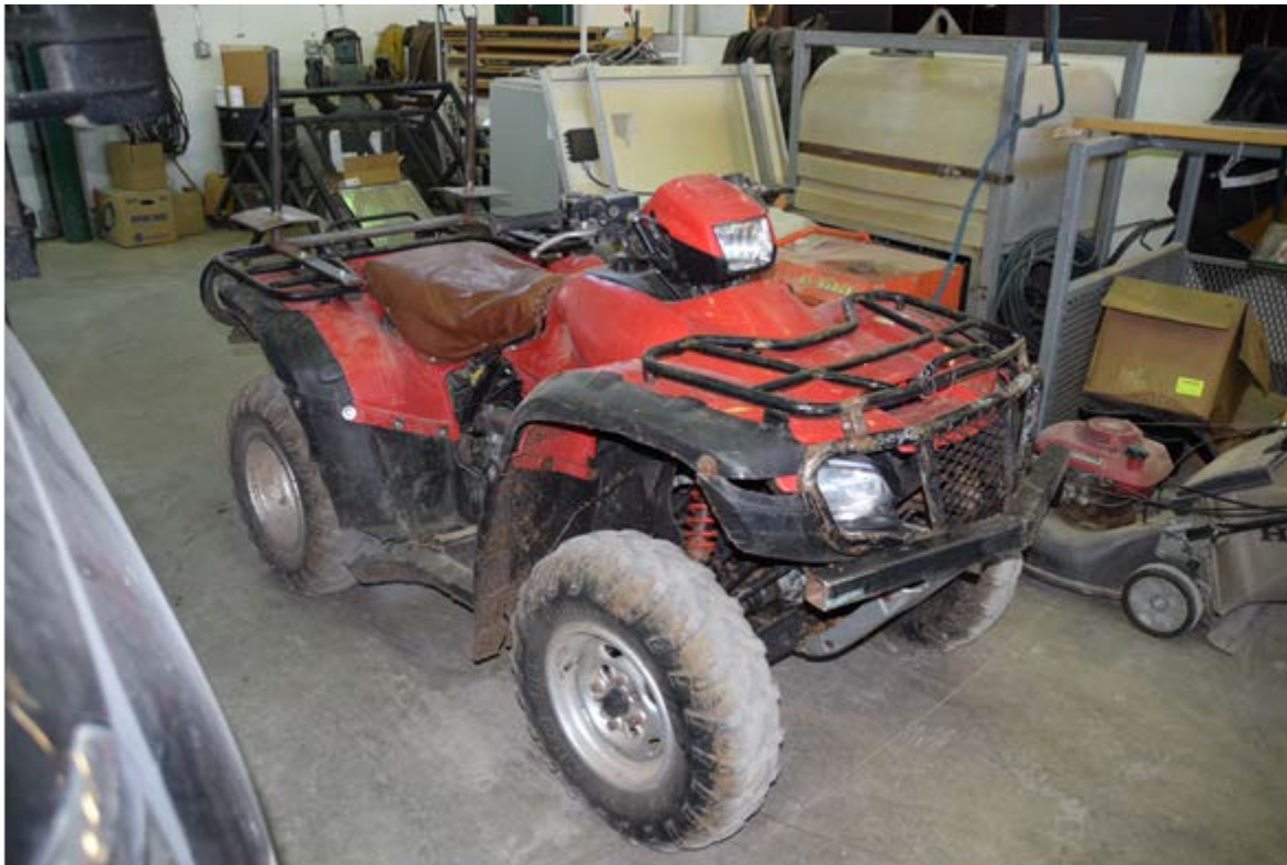
Figure 1. OHS photo of the ATV operated by the worker on the date of incident.

The tasks and activities associated with the incident, such as riding on gravel in an off road area, conformed to the manufacturer's intended use of the equipment.