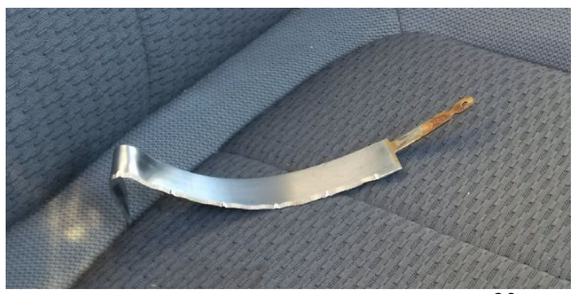
- 30 -