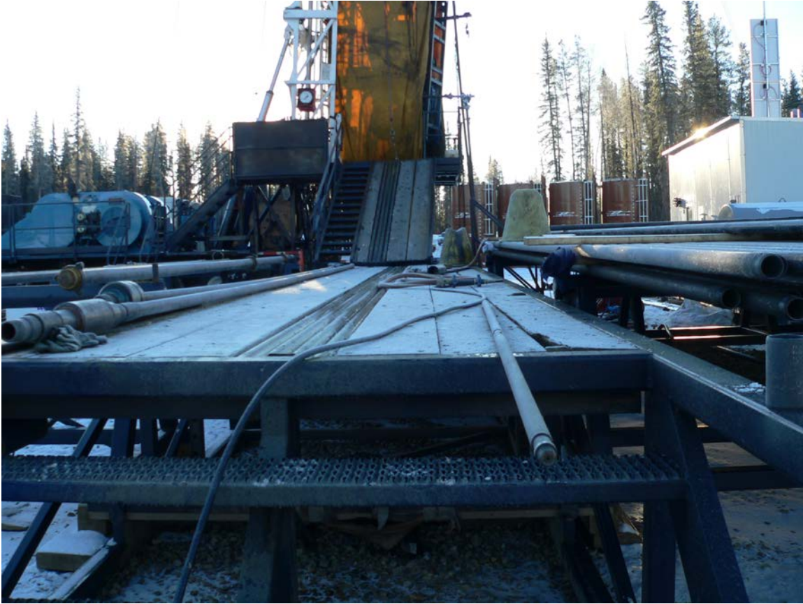
Photograph #2 Closer view of the catwalk where the tubing had been placed with the slickline tools stuck inside.