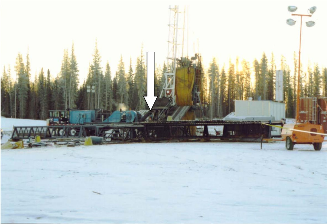
Photograph #1 The Brandette service rig set-up. The arrow is directed at the catwalk where the tubing had been placed.